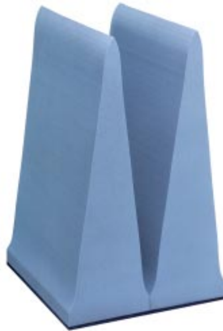
High Performance Hybrid Ferrite Tile/Polyurethane Dielectric

Meets ETSI Requirements for Absorber Return Loss