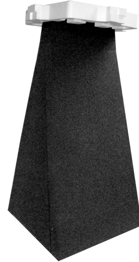
ETS-Lindgren's FS-1250H Anechoic Absorber