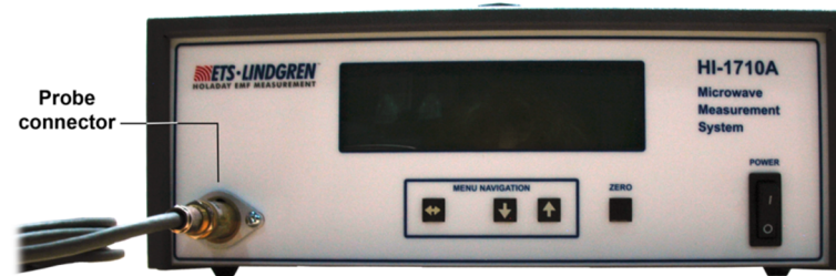
HI-1710A Front Panel