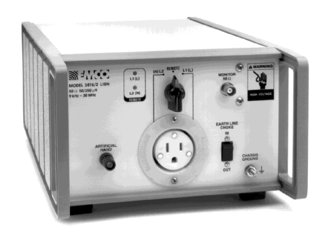
Model 3816/2 Front View

The ETS-Lindgren Model 3816/2 Line Impedance Stabilization Network (LISN) is a two-channel low pass filter network designed to isolate the Equipment Under Test from an external power source while steering any radio frequency signals from the power line to a 50-ohm port.