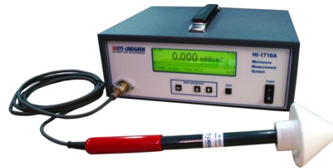
HI-1710A with HI-2623 Microwave Oven Probe

The ETS-Lindgren HI-1710A Microwave Measurement System combines the proven and reliable diode sensing technology of the ETS-Lindgren Microwave Survey Meters with the digital processing techniques developed for automatic oven scanning.