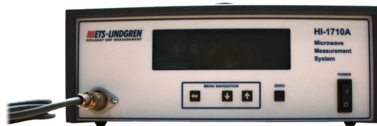
HI-1710A Front Panel