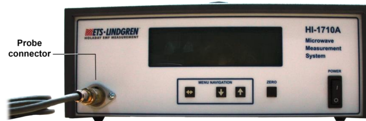
HI-1710A Front Panel