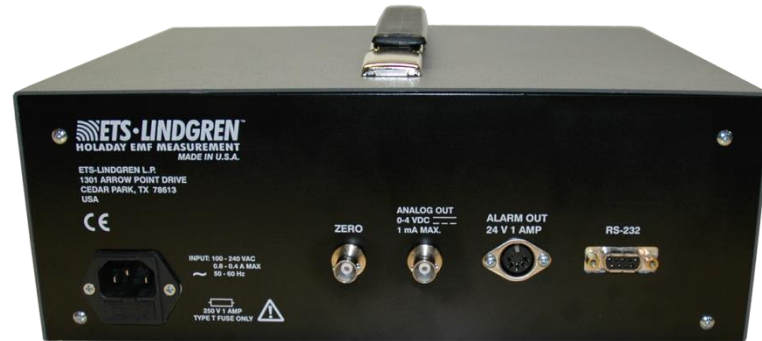
HI-1710A Back Panel